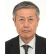
Hon. Yoshiaki Miawa Consul General of Japanese Consulate Office in Davao City