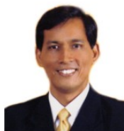
Go, Ronald C. Car Rentals